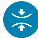
Short corridor available